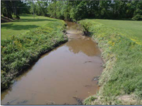
Figure 2. Before partners implemented BMPs, Turkey Creek carried high sediment loads during summer months.