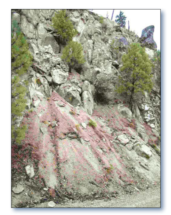
Figure 2. An eroding road cut in the South Fork Payette subbasin.

In addition, in 2009 DEQ measured 14.8 percent depth fines in pool tailouts (the areas just above or below rapids) in the fifth-order assessment unit. This meets the monitoring target of a 5-year depth fines mean of 27 percent or less with no individual year being greater than 29 percent (a target adapted from the South Fork Salmon River Subbasin Assessment, which was developed in 2005 and updated in 2009).