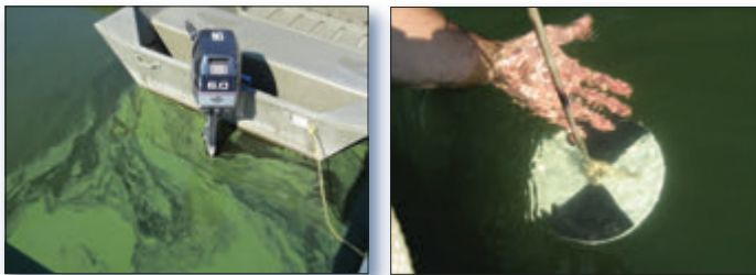
Figure 2. Water clarity before (left) and after (right) completion of restoration projects.

To address the sediment and nutrient sources, an Iowa Department of Agriculture and Land Stewardship (IDALS) project coordinator (based out of the Montgomery SWCD) worked with landowners to install erosion control practices, including five grade stabilization structures, 4,400 feet of terraces, seven water and sediment control basins, two sediment basins, and a livestock heavy use protection area on private land in the watershed. To address sediment sources in the state park (including 22 gully erosion sites), project partners installed 32 restoration practices, including grade stabilization structures, water and sediment control basins, wetlands, and a gabion basket drop control structure (Figure 1). Additionally, the Montgomery County Conservation Board (CCB) installed one grade stabilization structure and the Iowa Department of Transportation (DOT) stabilized four road culverts.