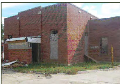
CHR Building prior to cleanup