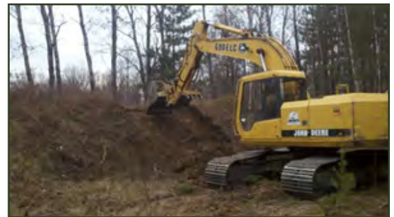
Cleanup activities at the former Old Range/Illegal Dump site.

Since 2012, the Band has been working with the Bureau of Indian Affairs (BIA) on the cleanup of an Old Gun Range/Illegal Dump Site. This property was originally constructed as a gun range by BIA in the mid 1980s. The property was used for the first five years as a gun range to qualify and certify conservation officers. After BIA stopped using it for that purpose, the property became used by some local residents for unauthorized target practice and illegal dumping. EPA conducted a Targeted Brownfields Assessment that identified the need to clean up lead contamination; the Band conducted further sampling and obtained funding from BIA for the cleanup that was completed in the fall of 2013.