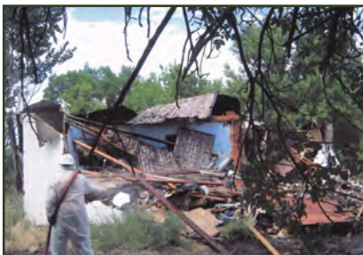
Cleanup activities on the reservation