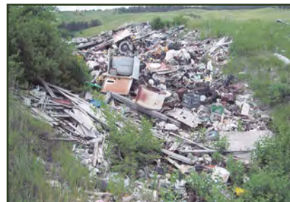
An open dump area on the reservation