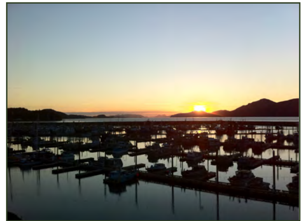
Sunset over Old Harbor in the Native Village of Eyak

NVE is using Section 128(a) Tribal Response Program funding to continue the process of developing an inventory of potential brownfields, and strengthen the tribe's capacity to identify and respond to contaminated sites within tribal lands. To date, the TRP identified over 20 potentially contaminated properties for its inventory and continues to solicit more properties. To increase its capacity for oil spill response, NVE held a 24-hour Spill Response course and a 40-hour Hazardous Waste Operations and Emergency Response (HAZWOPER) refresher course in October 2011 and will hold another in October 2014. In addition, NVE strives to reduce spills in our environment. In May 2012, NVE held a Home Heating Oil Tank Safety training event to increase its capacity to prevent spills and offers home heating tank inspections.