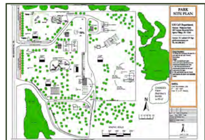
Tekakwitha Property – before, during cleanup and the redevelopment plan