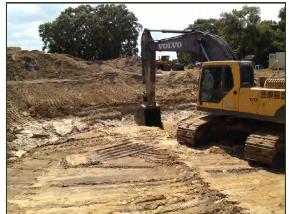
Excavation and stockpiling activities at the Red Barn property