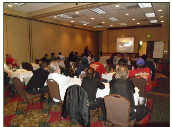
The White Earth Band provided training for 27 first responders; the topic covered First Response to Hazardous Materials Incidents

The White Earth Band of Ojibwa is using Section 128(a) Tribal Response Program funding develop an inventory of potential brownfields properties, and strengthen the tribe's capacity to respond to contaminated sites within tribal lands. In addition to the inventory, staff has begun to develop a Quality Assurance Project Plan.