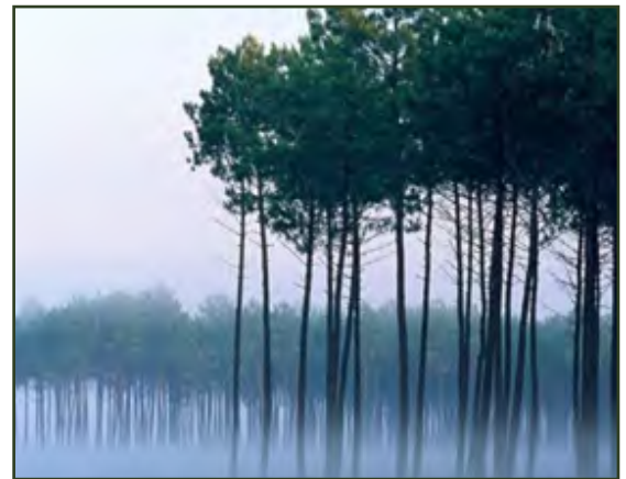
A tree-lined field on the Sault Ste. Marie Tribal lands.

The Sault Ste. Marie Tribe has used Section 128(a) Tribal Response Program funding to develop an inventory of potential brownfields properties and a public record to strengthen the tribe's capacity to respond to contaminated properties within tribal lands. In addition, the tribe has developed a website to help engage the community and educate tribal members about the importance to brownfields identification, assessment, and cleanup.