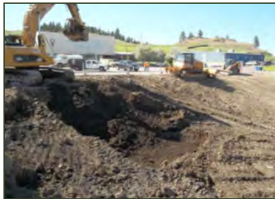
Excavation of a fuel contaminated hillside near Sundance Creek.

Chippewa Cree's Tribal Water Resources Department, a Section 128(a) Response Program grantee, and its Brownfields Coordinator assisted the U.S. Environmental Protection Agency's (EPA's) Environmental Response Team in responding to a major spill of unleaded gasoline at the Agency Pastime Gas Station in the summer 2012. After the initial report of the spill on May 21, 2012, it took time to investigate and discover the source of the spill, which turned out to be a leak from an above ground storage tank that flowed downward through the soil to surface in the Sundance Creek drainage. EPA and the tribe oversaw the rerouting of the creek, the removal of tanks, dispensers and contaminated soils, and the restoration of the site. The building was demolished and the contaminated soil was excavated and removed from the property. Monitoring is ongoing, however, the property is ready for reuse. The tribe is currently polling the public on ideas for reuse.