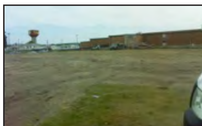
Old school after cleanup