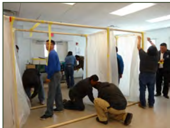
Asbestos training in Zuni Pueblo, NM

The Section 128(a) TRP at ENIPC-OETA has been working with the 22 pueblos and tribes in New Mexico and West Texas to promote the enhancement of environmental resources and environmental health while protecting tribal lands from environmental hazards. The program has completed a Phase I assessment at the Acoma McCarty Day School, and is currently working on a Phase I for the Picuris Gymnasium. The Brownfields program has also been facilitating and coordinating projects between the tribes and the New Mexico Environment Department. Current projects include Taos Old Clinic (Phase I completed), Santa Clara Old Courthouse (Phase I completed), Laguna Old High School (Phase I in process), and the Acomita Day School (Phase I in planning phase). In addition, the program has provided training opportunities for tribes and coordinating efforts with other agencies to bring the training to New Mexico. OETA has provided training for Lead, Asbestos and Mold Detection, x-ray fluorescence (XRF) analyzer training, Conflict Resolution (9 tribes, 15 participants), Community Revisioning at Acoma, 8 hr. Hazardous Materials Awareness (13 tribes, 38 participants) and Meth Awareness (8 tribes, 32 participants).