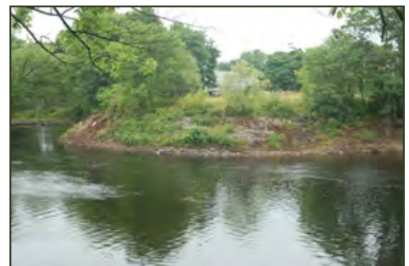
Former Foundry Property

The PIN/DNR is using Section 128(a) Tribal Response Program funding to continue developing an inventory of potential Brownfields properties and strengthen the Penobscot Nation's capacity to respond to contaminated sites within tribal lands. Most recently, the tribe is working to prepare a remediation plan to revitalize a riverfront property which was historically used as a metal foundry and machine shop. The tribe would like to develop this property into open greenspace with water access for fishing and small boats. Additionally, the tribe has completed two Phase I ESAs on the Penobscot River with the intention of utilizing the properties for agricultural uses including organic vegetable production. The properties are primarily undeveloped but have historically received significant urban fill. Phase II ESA investigations are currently being prepared to investigate if the urban fill has the potential to negatively impact human health and the environment, and vegetables farmed on the property.