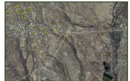
GIS map of abandoned homes on the Ute Mountain Ute Reservation

Through the Ute Mountain Ute (UMU) Brownfields tribal response program, the Tribal Brownfields Coordinator inventoried 138 properties consisting of abandoned homes, Tribal administration buildings, and numerous open dumps and landfills. One of the properties that the UMU Brownfields program addressed was an old closed landfill with a compromised cap and exposed garbage. UMU provided oversight for a Phase I and II environmental assessment at the property. Subsequent to that, the tribe applied and received an EPA Brownfields Cleanup Grant to make improvements to the landfill cap with a long term goal of installing a solar farm on the closed site. UMU Brownfields Program has held numerous meetings with the Tribal Government, tribal members, and other federal agencies to plan and organize the closed landfill project. A meeting among U.S. Environmental Protection Agency (EPA), Indian Health Services (IHS), and the tribe was held recently to develop a workgroup and identify areas where the federal agencies can help leverage resources to assist with the solar farm project. IHS is assisting with the remediation design and an EPA / Department of Energy (DOE) liaison is assisting with securing DOE funds for solar panels.