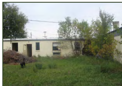
Old Jail property prior to cleanup