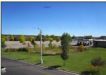
Old Casino after cleanup