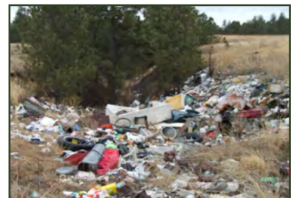
An open dump on the reservation