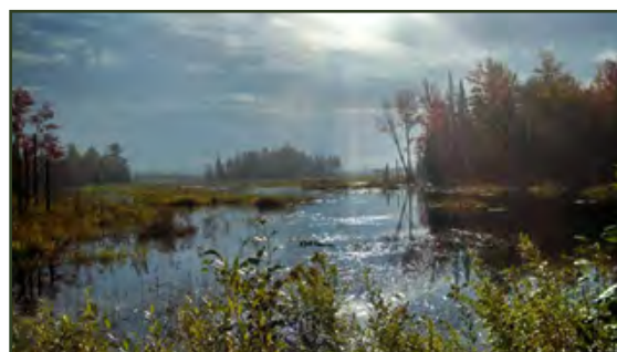
A lake and wetlands on the Lac du Flambeau Reservation