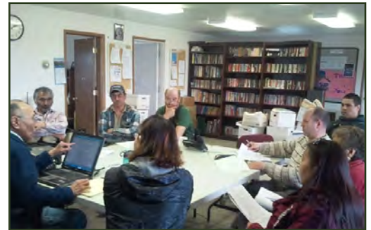
Tri-Council meeting in Pilot Point

One of the BBNA's current projects is assisting the Village of Pilot Point as they transition from completing a Targeted Brownfields Assessment (TBA) that will further identify contamination issues to their application for an EPA Brownfields Cleanup grant. Brownfields staff flew to Pilot Point before the busy commercial fishing season to meet with tribal members. BBNA gave a presentation on the success of tri-councils in Bristol Bay that resulted in Pilot Point entities, Pilot Point Traditional Council, the City of Pilot Point, and Pilot Point Native Corporation entering into a Memorandum of Understanding to create their own tri-council. Tri-councils in Bristol Bay villages allow tribes to accomplish brownfields projects more efficiently and in much shorter times. In addition, Pilot Point tribal members completed a 40-hour Hazardous Waste Operations and Emergency Response (HAZWOPER) training course and a 40-hour Asbestos Abatement class.