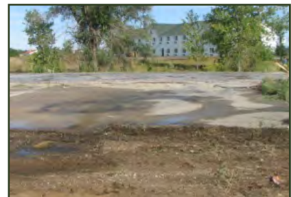
New basketball court