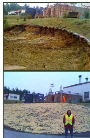
Interim Remedial Action at AOC D (Transformer Spill Site)

Since re-acquiring the former Naval Facility Coos Head in 2005, the Confederated Tribes have been working with the Air National Guard, Army Corps of Engineers, Navy, Bureau of Indian Affairs, and Oregon Department of Environmental Quality to investigate areas of known or suspected contamination and to remediate areas of concern. A presumptive remedy was implemented for munitions constituent sites, and an interim remedial action was completed for a transformer spill site. A Record of Decision is pending for the munitions constituent sites, a No Further Action determination is pending for the transformer spill site, and a Record of Decision is pending for four further action Comprehensive Environmental Response Compensation and Liability Act (CERCLA) sites and nine no further action CERCLA sites. Remedial action at the property was completed in 2013 and 2014.