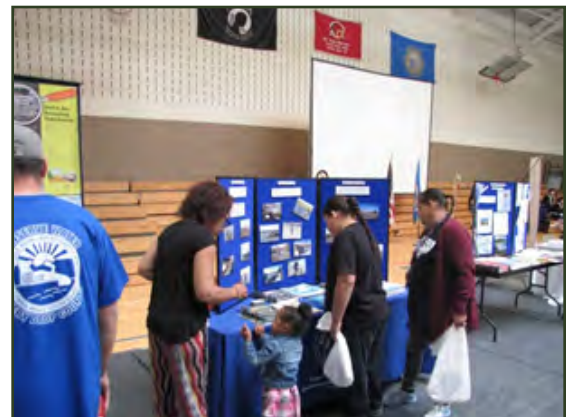
The LBST Brownfields Program booth at the Unity Day event.

LBST established the Public Record database, which can be located on its website, http://lbst-epo.org/brownfieldsprogram/ . LBST is surveying and inventorying its reservation and created a database for the inventory; the tribe updates the databases every six months or as necessary. LBST created a computer work station in the Environmental Protection Office and the public is invited to come in during working hours to access the public record on the internet. LBST also hosts a public meeting four times a year. To provide additional outreach and education to the community and children, the LBST Brownfields Program had an informational booth at the tribes' Unity Day event. To enhance the program's ability to provide technical and regulatory environmental response, the tribe sends its staff to training. In addition, LBST is establishing codes, policies, regulations and enforcement mechanisms. With the training experience and the establishment of the codes and policies, the Lower Brule Sioux Tribe conducted two Environmental Site Assessment Screens for the Former Housing Building and the Old Transfer Station.