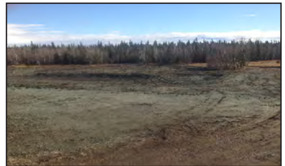
The Old Copper Valley School property after the completion of cleanup activities

The ANTHC TRP uses Section 128(a) TRP funding to foster public participation through outreach and education in tribal communities. ANTHC collaborates with communities to facilitate community meetings that focus on identifying, assessing and prioritizing potentially contaminated sites. One of these meetings was the catalyst that led to the Critical Removal Action at the Old Copper Valley School in October 2013. The 160-acre clean-up coordination was conducted in partnership with several agencies and organizations: The Native Village of Tazlina, Copper River Native Association, EPA, Alaska Department of Environmental Conservation and the Archdiocese of Anchorage. Future plans for the site include outdoor environmental education and subsistence activities.