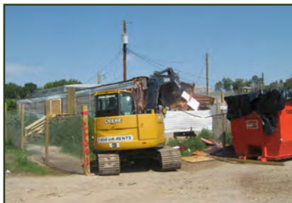
Cleanup of an abandoned house

Open Dumps – The Brownfields Tribal Response Program created an inventory of 120 illegal open dumps on the reservation. A consultant assisted with the creation of a spreadsheet that contained pertinent information on each property, which were also ranked and mapped. In addition, the contractor conducted Phase I and II assessments on the top 10 prioritized open dumps.