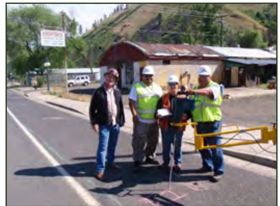
Groundwater Program installing soil vapor sampler.

The Nez Perce Tribe Water Resources Division responds to tanker truck accidents along U.S. Highway 12, which parallels the Wild and Scenic Lochsa/Clearwater River over the Bitterroot Mountains from Missoula, MT to Lewiston, ID. Response Program funding is used to train emergency responders, but not for emergency response. The Hazardous Emergency Response Team (HERT) Response actions are complementary to other responsibilities of the Groundwater Program, including LUST Prevention, LUST Assessment and Cleanup, and Brownfield Tribal Response Program. Under the program, the Nez Perce Tribe Water Resources Division is actively participating in four Phase II environmental site assessments, including the McCoy LUST site where the soil caught fire during road construction; Hunt Oil Seep where gasoline contaminated groundwater from an above ground storage tank that intermittently discharged gasoline into the Clearwater River; Lapwai School District UIC well which contaminated soil and shallow groundwater with chlorinated solvents approximately 100 ft from a municipal well; and a 37-acre brownfield site at Tribal Unit-45.