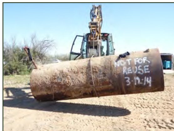
UST excavation and closure, March 2014

The Tohono O'odham Nation continues to use Section 128(a) Tribal Response Program funding to update an inventory of properties and participate in public outreach and community cleanup activities, and has developed a public record website: www.tonepa.org . U.S. Environmental Protection Agency (EPA) Region 9 Targeted Brownfields Assessment (TBA) assistance has been approved for 2014 including a gravel pit site with potentially buried drums containing unknowns and an old school building to determine contamination levels and alternatives for cleanup. Additionally, the Brownfields program helped fund removal of an underground storage tank (UST) while monitoring a second tank's removal in one district, and, is in the process of demolition of two condemned abandoned asbestos and lead containing buildings. Our annual Earth Day activities included a gardening challenge that involved hundreds of tribal members. The Nation's Brownfields program activities are contributing to a better educated people and a cleaner, healthier environment.