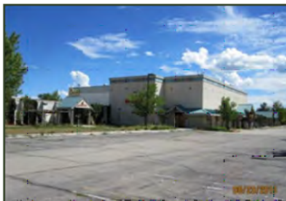
Old Casino before cleanup activities