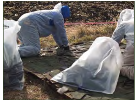
Asbestos Cleanup Activities on the Flandreau Santee Sioux Reservation

The Flandreau Santee Sioux Tribal Response Program (TRP) cleaned up four properties. The properties were assessed using EPA Targeted Brownfields Assessment (TBA) Program funding and the TRP used Section 128(a) Response Program funds to conduct cleanup activities with the assistance of a qualified environmental professional. The tribe worked closely with the South Dakota Historic Preservation Office to address National Historic Preservation Act 106 requirements because the properties had structures over 50 years old. One of the structures had asbestos containing vermiculite that had been used for insulation; collapsed ceiling boards had released the vermiculite throughout the building, creating a hazardous environment for people entering the property. In response, deteriorating asbestos roof shingles and other asbestos-containing materials were removed and properly disposed of. The properties are once again suitable for redevelopment—including residential reuse.