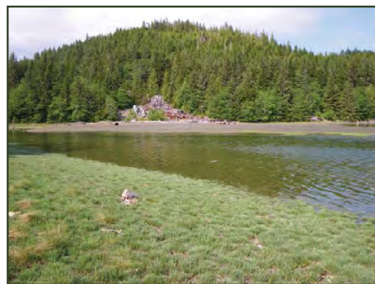
Dilapidated structures at the Salt Chuck Mine site as seen from across Ellen Creek

In April 2013, the Village held its annual POW Island-wide Mining Symposium. The event included representatives from the offices of Governor Parnell, Senator Mark Begich, Senator Lisa Murkowski, the Niblack Project, Ucore Rare Metals, Inc., SEALASKA Corporation, U.S. Department of Agriculture-U.S. Forest Service, Alaska Power and Telephone, State of Alaska Department of Natural Resources, and several tribes discuss mines on POW. The event updated residents on activities and concerns with mining occurring on the island, garnished local support, promoted the development of a local work force, and served as a forum for natural resource education.