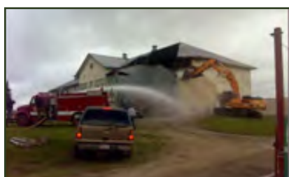
Old school during cleanup