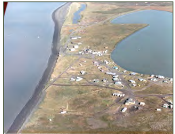
Aerial View of the Native Village of Port Heiden.

Over the last several years, the Native Village of Port Heiden used Section 128(a) Tribal Response Program (TRP) funding to initiate the development of a tribal response program. They focused their funding on developing an inventory of properties and a public record, obtaining technical training for staff members, and conducting outreach and education to engage the community in environmental and brownfields issues. The Village of Port Heiden TRP attended the Alaska Forum on the Environment in Anchorage. The forum provided an opportunity for state, local, military, private, and Native leaders and professionals to come together and discuss the latest projects, processes, and issues that affect Alaska. In addition, the TRP attended the Alaska State and Tribal Response Program (STRP) Workshop in Fairbanks. This workshop helped the TRP map its priority list and network with other tribes and native villages. The TRP also investigated the project proposed to work on cleaning up a few buildings in the old village of Meshik. Based on a previous Brownfield assessment Phase I and II reports on the Old Meshik Town Project these two properties needed further investigation. Although the TRP conducted additional investigations, the projects were halted because several storms caused massive erosion to the coastlines and the buildings on the properties collapsed onto the beach. The Village of Port Heiden removed the two buildings that were destroyed.