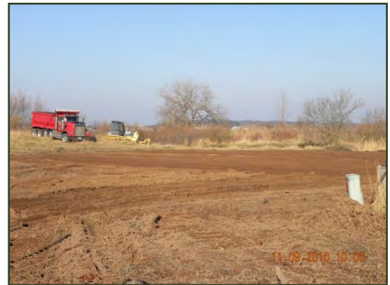
Excavation activities at the Eastlake property