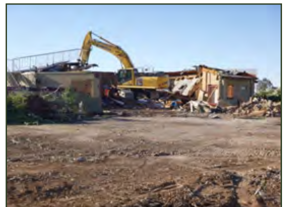
Scottsdale Six Drive-in Theater Concession Building During Cleanup.

SRPMIC recently used Section 128(a) TRP funding to complete a Phase I investigation at an illegal dump site known as the "Beeline Gravel Pit." CDD/EPNR continues to evaluate areas of contamination to add to the potential brownfields site inventory database. Continued funding has also allowed for the increased involvement of the community, bringing awareness and allowing for its participation in locating and identifying sites. The TRP grant also funded the initial investigations that allowed SRPMIC to conduct cleanup at the abandoned "Scottsdale Six Drive-in Theater," which is located in a highly transited area of the reservation. This land will be ready for reuse in the near future and allows an income benefit to the landowners. CDD/EPNR will continue to do assessments and cleanups with the use of Site Specific Funds under the TRP grant.