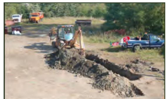
Phase II test pitting activities conducted at the Passamaquoddy Public Works Garage Site

The Passamaquoddy Tribe used Section 128(a) Response Program funding to conduct assessment activities on two properties, the Passamaquoddy Public Works Garage and the Penknife Lake property. Recently, the tribe conducted Phase I and Phase II ESAs at the Passamaquoddy Public Works Garage. This property was historically used as an auto-repair shop and informal landfill for bulky waste. The property is located immediately upslope of traditional shell-fishing grounds and is currently used to store and maintain public works vehicles and the tribe's winter road-salt pile. The results of the Phase II indicated that concentrations of semi-volatile organic compounds are present in adjacent freshwater sediments. The investigation also identified high salinity concentrations in surface and ground water. As a result of the investigation, the tribe will consider further evaluation of the adjacent shell-fishing grounds and determine the feasibility of constructing a fixed structure over the salt pile. Additionally, the Passamaquoddy Tribe conducted a Phase I at a potentially impacted property on Penknife Lake. Land at the Penknife Lake property will be dedicated to the development and enrichment of tribal youth through traditional activities such as hunting, fishing and camping.