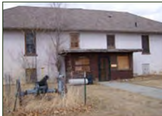
Spotted Bull Treatment Center