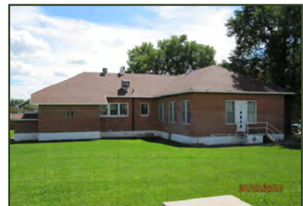
Old Cafeteria property