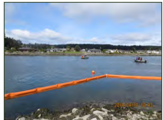
Oil Spill Response Training