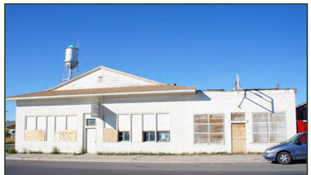
Blackfeet Mainstream building is one of 13 designated brownfield properties on the Blackfeet Reservation