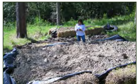
Onsite land farming treatment of heavy oil/SVOC contaminated soil.

In FY2013, TRP staff performed preliminary site inspections on eight Tribal properties and recommended lead and asbestos testing of older buildings on two of those properties. When the results came back positive for asbestos, institutional controls were put into place on one of the buildings and the other building was demolished and hauled to a facility that accepts asbestos. These two properties will be re-developed for Tribal housing. During one of the preliminary site inspections, an empty 500-gallon above-ground storage tank (AST) was discovered. The Tribe hired an environmental contractor to perform a Phase II Environmental Site Assessment. When the soil in the area of the AST was sampled, high levels of heavy oil and semi-volatile organic compounds (SVOCs), which exceeded MTCA Method A and Method B cleanup levels, were found. The area was sampled for the lateral and vertical extend of the contamination. Approximately 20 cubic yards of contaminated soil was removed from the subsurface and placed in two berms and treated onsite for three months using land farming techniques. When the soil was re-tested it was found to be free of contamination. The property on which this cleanup was performed is slated to be re-developed as the site of the Tribe’s Membrane Bioreactor plant.