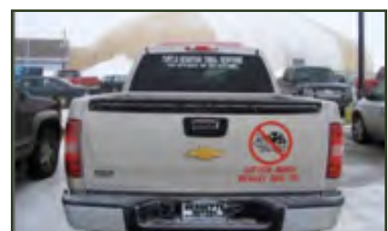
Compliance Officer enforces codes