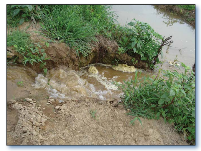
Figure 2. Erosion during agricultural runoff contributed sediment to the St. Francis River.