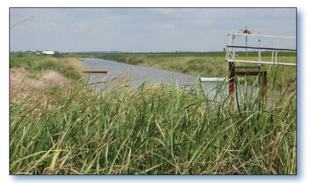
Figure 3. Landowners installed drop pipes that discharge runoff water directly into a waterbody to avoid erosion.

In 2010 the Poinsett County Conservation District (PCCD) followed CCCD's lead and began providing financial and technical assistance to landowners to help implement water control structure BMPs. The PCCD implementation project, also supported by CWA section 319 funds from the ANRC, resulted in the addition of 287 water control structures on 63 different farms.