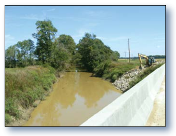
Figure 2. A project participant installs a drop pipe structure, which will allow the discharge runoff water to empty directly into Bayou DeView rather than drain across an erosion-prone field.

In 2004 TNC proposed a work plan for a series of integrated sediment, hydrology, geomorphology and biology monitoring surveys. The surveys culminated in a report and spatial relational database containing a priority ranking of the Cache River's tributary streams. Because of the short length of the study (one year), however, no flow regime or water quality trends could be established for statistical predictions.