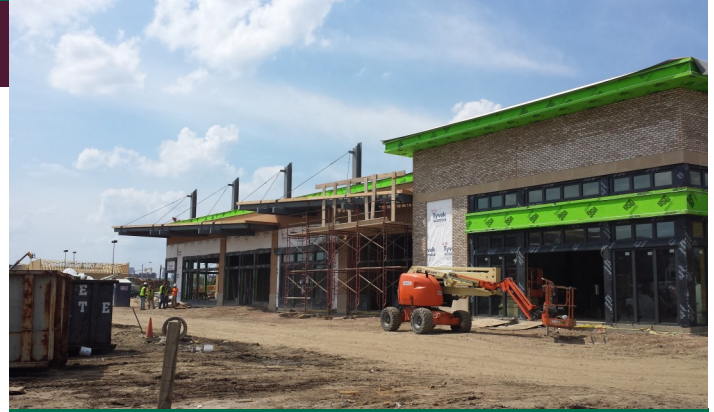
Site construction (above) and final result (below).

This property won EPA Region 3's 2007 Phoenix Award for Excellence in Brownfield Redevelopment.