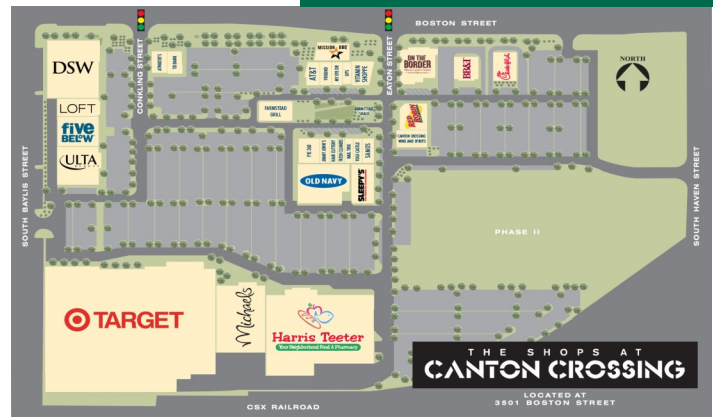
Map of Canton Crossing retail mall