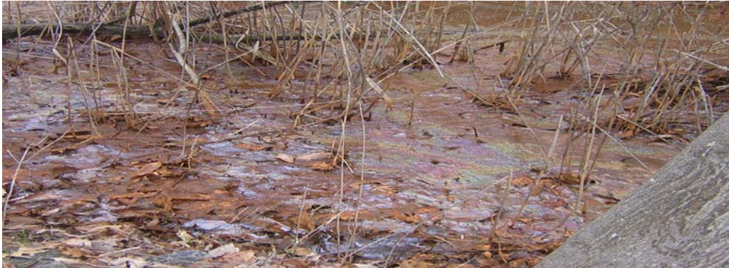
Iridescent sheen at Wildcat Landfill, April 2008.

During our physical inspection of the site we observed a sheen on the surface waters throughout the site. The sheen was iridescent and oily in appearance (see photo below). While this sheen could be harmless, it could also indicate the presence of a petroleum product. Region 3 personnel said they were aware of the sheen at the Site but had concluded that it was naturally occurring.