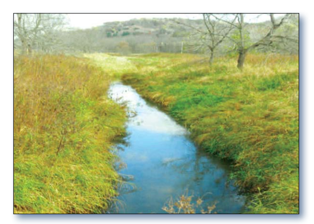
Figure 3. Joos Valley Creek, after stakeholders restored the stream and implemented erosion control practices in the watershed.

Between 1990 and 2007 WDNR and the U.S. Geological Survey (USGS) collaborated on a long-term study examining the effects of BMP implementation on water quality in Eagle and Joos Valley creeks. The study monitored levels of TSS, ammonia nitrogen, and phosphorus (1) before BMP implementation, (2) during the installation phase and (3) for a seven-year period following BMP implementation. Results show significant decreases in the median loads of TSS in both creeks—an 89 percent decline in Eagle Creek and an 84 percent decline in Joos Valley Creek. These reductions exceeded the TMDL goal of a 58 percent TSS reduction. Study results also show declines in total phosphorus and ammonia in Eagle Creek (77 percent phosphorus and 66 percent ammonia nitrogen reduction) and Joos Valley Creek (67 percent phosphorus and 60 percent ammonia nitrogen reduction) between pre- and post-BMP implementation. WDNR estimates that pollutant load reductions and water quality improvements are due to changing land practices and livestock herd reductions in the watershed. On the basis of these data, WDNR removed both creeks from the state's list of impaired waters in 2012 for TSS.