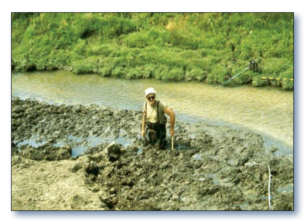
Figure 2. Before restoration, erosion contributed excess sediment, which collected and formed this mud bank on Joos Valley Creek.

the creek waterways; and installed in-stream structures that provide streambank stability and edge-cover aquatic habitat. Farmers also implemented cropland and nutrient management practices on approximately 470 acres of highly erodible lands and installed erosion control structures and grassed waterways to decrease soil erosion due to stormwater runoff (Figures 2 and 3).