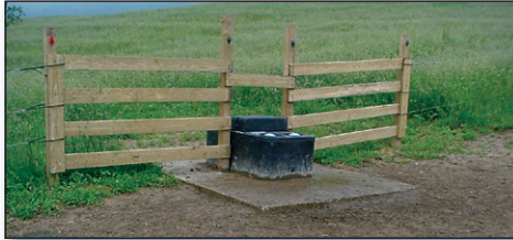
Figure 2. Willis River landowners installed numerous BMPs, such as stream crossings (top) and alternative water sources (bottom).

alternative water systems, composting facilities, animal waste storage, livestock stream exclusion with grazing land protection systems, and riparian buffers. For example, landowners added 168,960 feet (32 miles) of fencing that created more than 129 acres of buffers and prevented approximately 3,944 head of livestock from accessing streams or farm ponds. Landowners also improved approximately 1,780 acres of pastureland. For the residential BMP program, PFSWCD helped homeowners implement numerous septic projects to date, including 14 septic tank pump outs, four septic system repairs, and four septic system replacements. Of the four replacements, one is complete and three more are under contract.