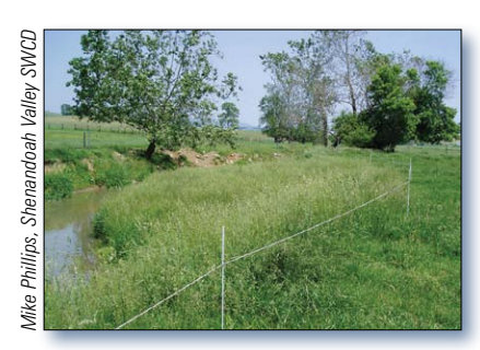
Figure 2. Livestock exclusion fencing was voluntarily implemented in the Muddy Creek watershed.

5,514 feet of livestock exclusion fencing, planting 14 acres of riparian buffers, establishing permanent vegetative cover on 108 acres of cropland, establishing no-till forage production on 26 acres and cover crops on 4,030 acres, and building 14 animal waste control facilities and eight loafing lot management systems. SVSWVD staff also worked with homeowners to pump out 41 septic systems and