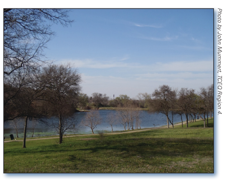
Figure 1. Fosdic Lake is in East Fort Worth, Texas.

Legacy pollutants are substances that have been banned or restricted but remain in the environment. Chemical substances like chlordane, DDE, dieldrin and PCBs were widely used as pesticides, coolants and lubricants from about 1946 until they were eventually restricted between 1972 and 1988. In spite of the restrictions on the substances, area soils continued to be contaminated through direct application, leaks and spills. Extensive urban development from the late 1950s until the early 1990s caused contaminated soils to erode and accumulate in Fosdic Lake. The pollutants then entered the food chain and became concentrated in fish tissue.