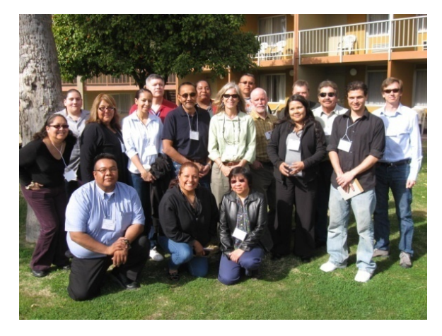
Climate Change Adaptation Planning Tucson, AZ

Climate Change on Tribal Lands Flagstaff, AZ