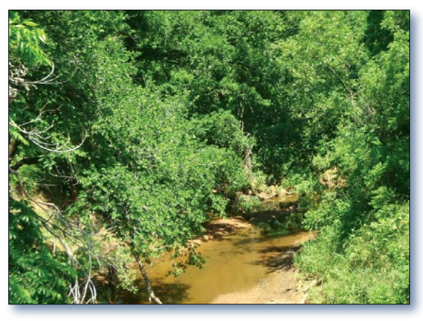
Figure 1. Tepee Creek flows through Kiowa County in southwest Oklahoma.

Landowners implemented BMPs with assistance from Oklahoma's locally led cost-share program and through the local Natural Resources Conservation Service (NRCS) Environmental Quality Incentives Program, Conservation Reserve Program, Conservation Stewardship Program and general technical assistance program. These projects focused on reducing erosion by improving cropland and grazing lands. From 2006 to 2012,