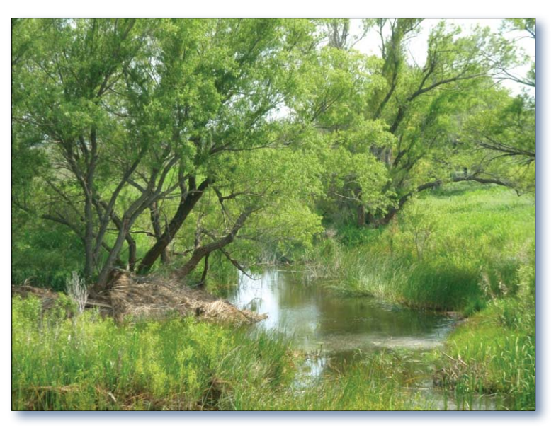
Figure 1. Stinking Creek is in central Oklahoma.

Landowners implemented BMPs with assistance from Oklahoma's locally led cost-share program and through the local Natural Resources Conservation Service (NRCS) Environmental Quality Incentives Program and general technical assistance program. These projects focused on