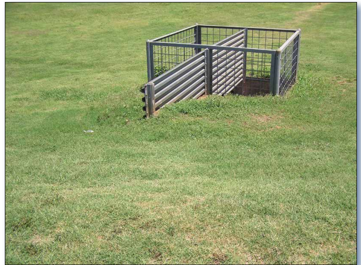
Figure 2. Installing grade stabilization structures reduced erosion.

The Oklahoma cost-share program provided $3,916 in state funding for BMPs in this watershed through the Upper Washita and North Fork of Red River conservation districts, and landowners contributed $3,786 through this program. NRCS spent approximately $3.5 million for implementation of BMPs in the watershed from 2008 to 2011 through EQIP, CSP, and general technical assistance funds. Landowners provided a significant percentage