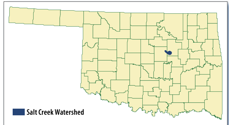
Figure 1. Salt Creek is in central Oklahoma.

In addition, a 2010 water quality assessment showed an E. coli geometric mean of 158 colony forming units (CFU) per 100 milliliters of water in Salt Creek. E. coli are bacteria common in animal waste and can cause human illness. These bacteria are used as an indicator of the possible presence of other harmful pathogens. Waterbodies with a geometric mean above 126 CFU during the recreation season (May 1–Sept. 30) are considered impaired for primary body contact recreation due to an unacceptably high health risk from waterborne diseases. On the basis of these assessment results, Oklahoma added Salt Creek to the CWA section