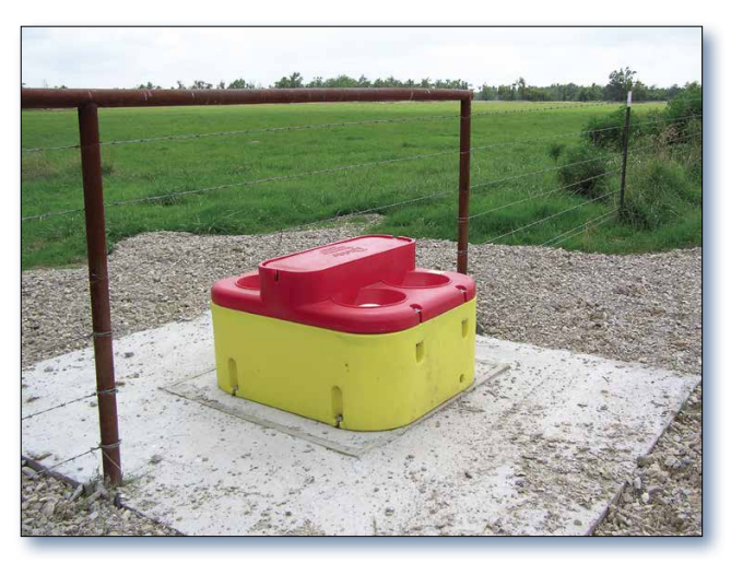
Figure 2. Installing alternative water supplies and cross-fencing allows optimal grazing management, which improves pasture condition, reduces erosion of soil and nutrients, and ultimately improves water quality.

The Oklahoma cost-share program provided $4,142 in state funding for BMPs in this watershed from 2001 to 2006 through the Woodward County Conservation District, and landowners contributed $7,564 through this program. An additional $23,000 in BMPs was installed in 2009. NRCS has spent more than $2 million for implementation of BMPs in