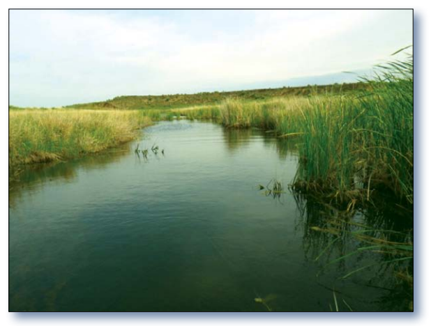
Figure 1. Duck Pond Creek flows through an agricultural region in northwestern Oklahoma.

Landowners implemented BMPs with assistance from Oklahoma's locally led cost-share program and