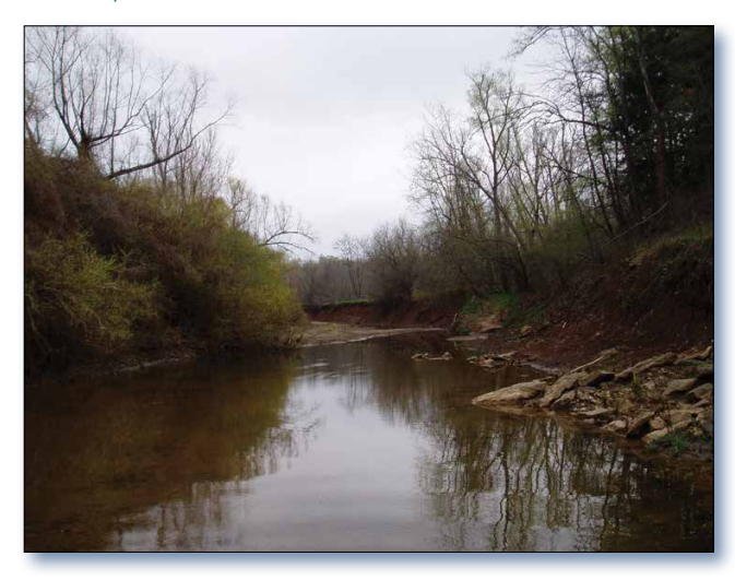
Figure 3. Bird Creek is now in partial attainment of the fish and wildlife propagation designated use.