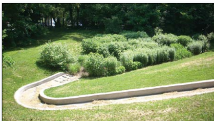
Figure 2. LID project installed during Phase V of the Sligo Creek restoration effort.

In Phase IV (1999), the county created two stormwater wetlands and conducted restoration work in middle Sligo Creek to help return stream segments to more natural conditions that support aquatic life habitat needs (e.g., replacing straight-line concrete channels and pipes with meandering channels with varied stable bottom).