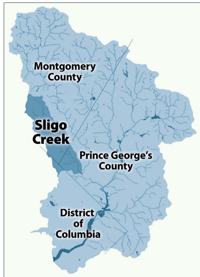
Figure 1. Maryland's Sligo Creek subwatershed drains a densely populated area near Washington, DC.

In addition, MDE has listed the Anacostia watershed for the following impairments (with listing years): nutrients (1996), sediments (1996), fecal coliform bacteria–non-tidal waters (2002), toxics–polychlorinated biphenyls (PCBs) (2002), toxics–heptachlor epoxide (2002), fecal coliform bacteria–tidal waters (2004), and debris/floatables/trash (2006). TMDLs have been approved for biological oxygen demand/dissolved oxygen, phosphorus, nitrogen, sediments, fecal coliform, PCBs and trash.