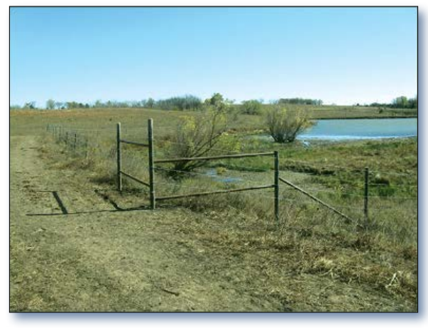
Figure 2. A landowner installed this livestock exclusion fence to reduce organic loading to surface waters.

4,606 linear feet of pipeline to support the alternative watering systems; and 44,574 linear feet of livestock exclusion fencing (Figure 2).