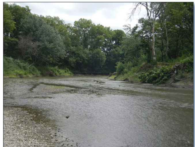
Figure 3. Nine segments of the Cottonwood River were removed from the state's list of impaired waters for bacteria.

EPA Region 7; NRCS; KDHE; and participating landowners.