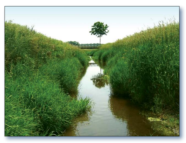
Figure 2. Buck Creek in the summer of 2011, after extensive BMP implementation.

Since 1990 IDEM has directed $900,747 in CWA section 319 funds and $53,997 in CWA section 205(j) funds, as well as $543,300 in local in-kind