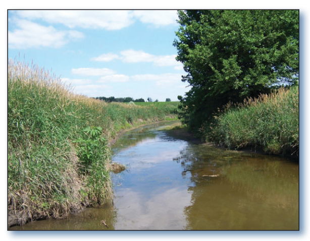
Figure 1. Agricultural activities are the dominant land use surrounding Bull Run.

Bull Run data collected in 1999 revealed a fish IBI score of 0, and West Creek data collected in 2004 and 2005 showed an IBI score ranging from 16 to 32 (Figure 2). As a result, IDEM added both Bull Run (in 2002) and West Creek (in 2008) to the state's CWA section 303(d) list because of impaired biotic communities. No TMDL was developed for Bull Run/West Creek.