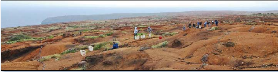
Figure 3. Volunteers plant native shrubs and grasses for Hakoawa's revegetation.

annually. Specific activities undertaken by the project include developing erosion control BMPs, removing and controlling alien animal and plant species, and refining revegetation techniques (Figure 3).