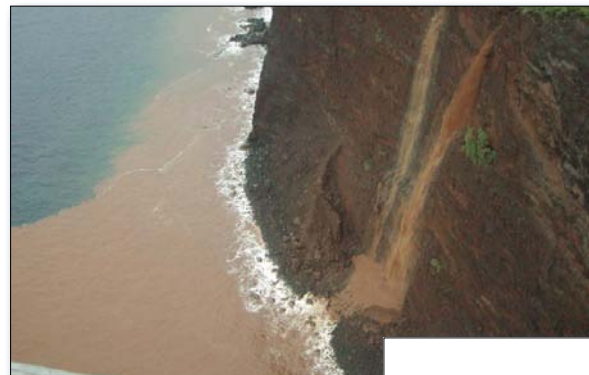
Figure 1. A lack of vegetation leads to excessive erosion on Kahoʻolawe, which in turn causes sediment loading into adjacent marine waters.

The Hawaii Department of Health, Polluted Runoff Control Program (PRCP), has provided Clean Water Act (CWA) section 319 funding to KIRC to initiate erosion control, reestablish native plant communities, and improve water quality affected by excessive sedimentation. KIRC is managing the island and its resources until the island can be transferred to