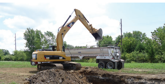
A backhoe is removing asbestos-containing materials from the site.