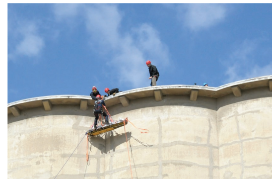
Fire and emergency medical services staff are participating in high-altitude rescue training on the repurposed storage silos.