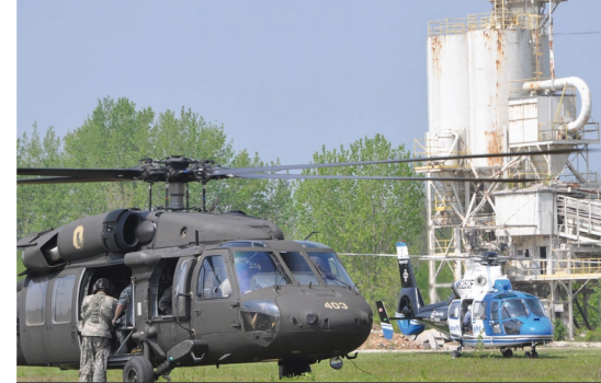
Military and civilian emergency responders conduct joint exercises at the National Center for Medical Readiness.

"The keys to success are finding an end user for the land and having a vision to help market the site you're going to clean up," McDonnell says. "And allow for flexibility in the business plan for when unexpected issues arise."