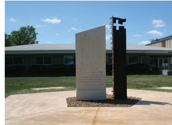
A World Trade Center memorial was erected in front of the center's offices.