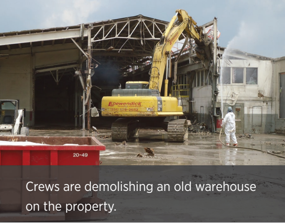
Crews are demolishing an old warehouse on the property.

“One of the unique features of the site is the ability to research and test new technologies, clothing and equipment used at disaster scenes to improve safety for responders and enhance medical treatments without having to rely on trial and error during a real disaster.”