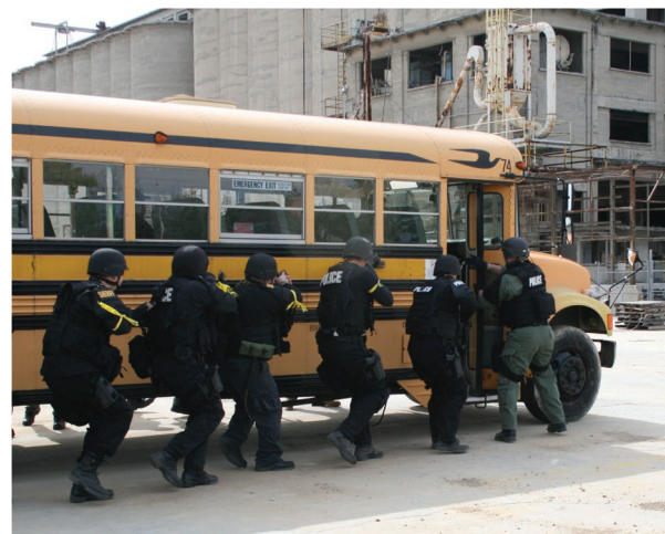
Police are conducting a hostage rescue and extraction exercise on a school bus at the Calamityville® training facility.