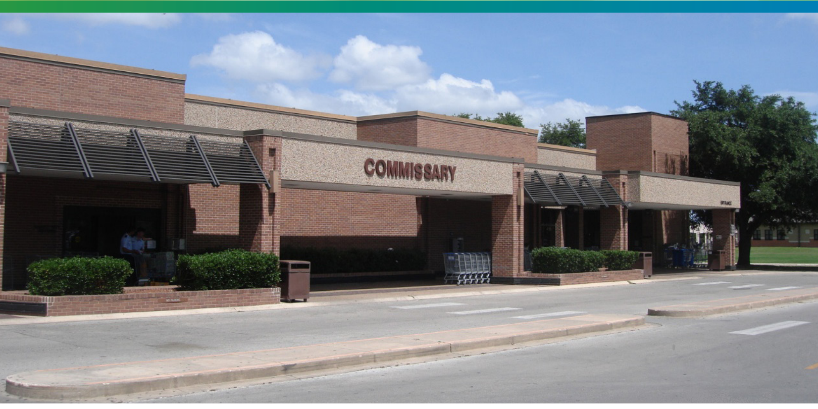
Outside the Lackland commissary.