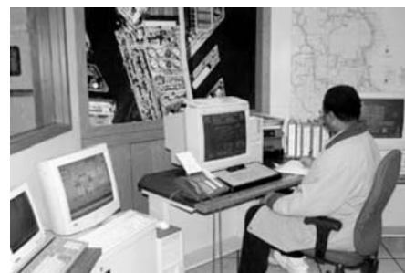
The Milwaukee Metropolitan Sewer District uses real-time data to monitor the flow in its sewer system tunnels and pipes.

Sewer separation can be highly effective in controlling the discharge of untreated wastewater. Under ideal circumstances, full separation can eliminate CSO discharges. A survey of readily available information in NPDES files indicates that sewer separation is the most widely used CSO control, accounting for half of CSO control measures found in LTCP