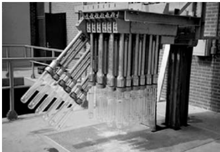
Ultraviolet light is used to disinfect wet weather flows as part of the Columbus, Georgia, Water Works CSO Technology Testing Program.