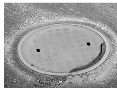
Damaged manholes, such as the broken cover shown above, can be a significant source of storm water I/I into an SSS.

In-line or in-system storage is the term used to describe storage of wet weather flows within the sewer system. Taking advantage of storage within the sewer system has broad application and can often reduce the frequency and volume of CSOs and SSOs without large capital investments. Maximization of storage in the sewer system is also one of the NMC required of all CSO communities. The amount of storage potentially available in the sewer system largely depends on the size or capacity of the pipes that will be used for storage and on the suitability of sites for installing regulating devices.