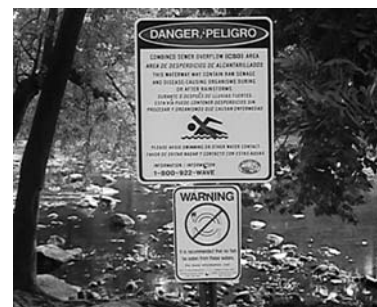
This CSO notification sign is posted along Brandywine Creek in Wilmington, Delaware, as part of a public notification program. It warns swimmers of the presence of a CSO outfall and advises that raw sewage and bacteria may be present after a storm.