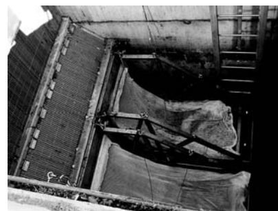
In-system netting can provide floatables control at strategic locations in the sewer system.

Water conservation is the efficient use of water in a manner that extends water supplies, conserves energy, and reduces water and wastewater