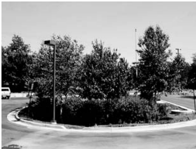
Bioretention systems can reduce the amount of storm water runoff generated by impervious surfaces, such as parking lots, that enters a CSS during wet weather.

In developing and implementing a CSO LTCP, municipalities are expected to consider more significant structural