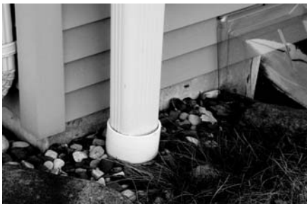
The direct connection of roof leaders (shown above) and other inflow sources can limit sewer system capacity for conveying sanitary wastewater during wet weather.

Seattle was one of the first U.S. communities to implement and operate an advanced real-time control system to control CSO discharges. Seattle's system, called Computer Augmented Treatment and Disposal (CATAD), began operating in 1971. In the late 1980s, treatment plant computer hardware was upgraded, remote telemetry units at regulators and pump stations were replaced by programmable logic controllers, and graphical displays used by operators were improved. Based on the success of the CATAD technology, Seattle implemented a new, predictive real-time control system that went on-line in early 1992. Rainfall prediction capabilities that utilize rain gage data and a runoff model were added. A global optimization program was introduced that computed optimal flow and corresponding gate position for each regulator within the CSS. A distributed network allows control decisions to be implemented without operator intervention. The computer program uses real-time operation and system performance data to predict or forecast conditions through the system and directs control elements to utilize in-line storage during periods of high flow.