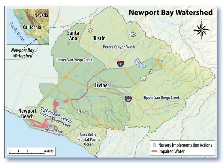
Figure 1. San Diego Creek is in Southern California's 154-square mile Newport Bay watershed.

In 2002 the U.S. Environmental Protection Agency (EPA) established total maximum daily loads (TMDLs) for San Diego Creek and Newport Bay by consent decree, which the Santa Ana Regional Water Quality Control Board adopted in 2003. These TMDLs established numeric targets for diazinon and chlorpyrifos and outlined a series of implementation actions to reduce pesticide loading.