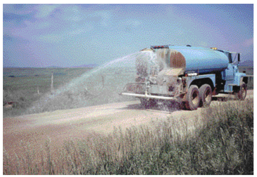
A water truck being used to prewet some very dry gravel just prior to treatment. This dramatically improves the success of the treatment.

The outcome from the failed test section will present an opportunity to analyze what may have gone wrong. Another test section can then be tried with a modified process and/or materials. If field performance proves satisfactory, the process can then be applied to larger jobs.