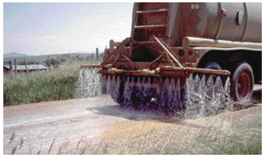
Example of a good piece of application equipment. This truck has a pressurized spray bar with a computerized application system that meters the liquid Chloride with extreme accuracy.

The most important need here is for equipment that can be calibrated accurately and that will apply either the liquid or flakes evenly across the surface. Then a good application rate needs to be selected. This will vary with the type of gravel being treated and the length of time dust control is needed.Check with vendors and experts in your area to see what recommended rates are. Next, watch the weather! If rain is forecast or appears to be likely, don't take a chance. Rain on a freshly treated surface will leach out and dilute the Chloride and cause it to run off the road. It can temporarily harm grass on adjacent areas. But the bigger problem will be very poor performance afterwards. Also, it is ideal to keep traffic off of the road for up to two hours after application. This is not always possible, but it is very helpful. It is recommended that one side of the road be treated at a time. Rolling can be helpful, but is not essential. If rollers are used, pneumatic ones are best, and watch to see that the gravel does not start picking up from the surface. If that happens, wait until the surface cures a bit before finishing rolling.