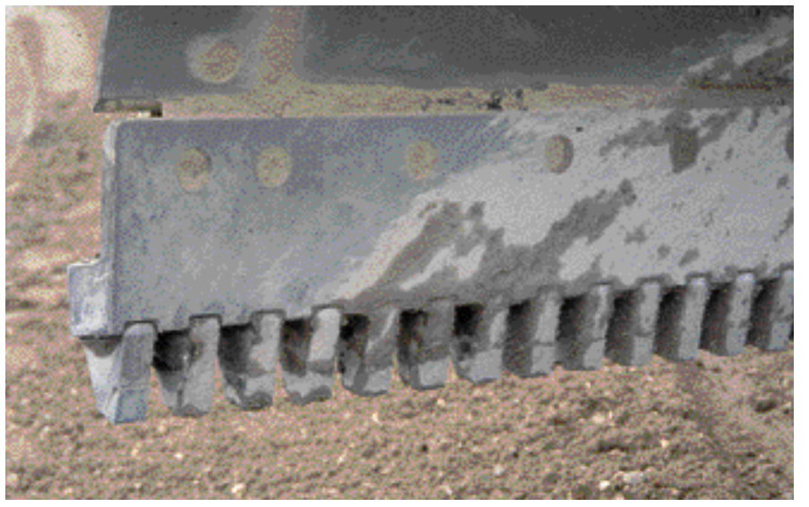
The carbide-tipped bits on a cutting edge can be a valuable tool in preparing a road for Chloride treatment. They penetrate the road and give a shallow scarifying effect to loosen and mix the existing gravel. This leaves a nice uniform loose layer of material on the surface.

This is another critical point in preparing for dust control treatment.Make sure the road has a good crown in the driving surface. Also, make sure there is good shoulder drainage. Standing water anywhere in the roadway will cause the surface to soften and fail. It will leave a pothole in an otherwise good, stabilized roadway. These can be hard to correct afterwards without disturbing the stabilized surface around it.Another key to preparation is to loosen a minimum of one to two inches of the existing surface and leave it loose at a uniform depth across