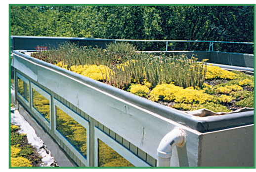
The Matthew Henson Conservation Center in Washington, DC, utilizes a green roof.

Overall, when developing a stormwater management plan on a brownfield, surrounding sites must be considered. (Source: Flint Futures: Alternative Futures for Brownfield Redevelopment in Flint, Michigan.)