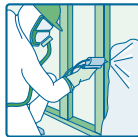
Two-Component High Pressure SPF

If you experience breathing problems or other adverse health effects, seek immediate medical attention.