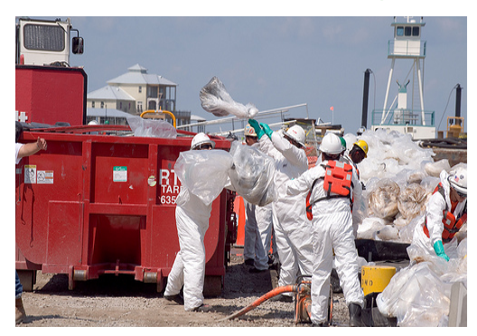
Oil collected in bags being put into containers for landfill disposal.

Although increased federal oversight of BP's waste management activities improved transparency and provided additional measures to protect the environment and public health during the Gulf Coast oil spill response, EPA did