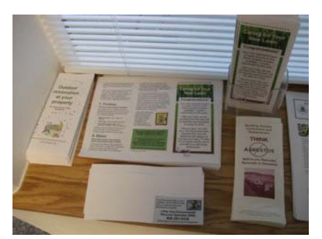
Handouts at the EPA information center in Libby.

The Libby site includes portions of the towns of Libby and Troy, Montana. An inactive vermiculite mine contaminated with naturally occurring asbestos is located 7 miles outside of Libby. About 12,000 people live within a 10-mile radius of the town of Libby. EPA has conducted cleanup activities at the Libby site since 2000.