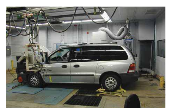
A vehicle undergoing a dynamometer test to measure vehicle emissions.

EPA was not recovering all reasonable costs of administering the program. We found a $6.5 million difference between estimated program costs of $24.9 million and fee collections of $18.4 million, based on the Agency's cost estimate for FY 2010. EPA's final rule of May 2004 limits the annual fee increases to inflation adjustments to EPA's labor costs. The rule does not allow fee increases to cover EPA's increasing costs. EPA has not conducted a formal cost study since 2004 to determine its actual program costs, and has not updated the formula in the 2004 fees rule to recover more costs.