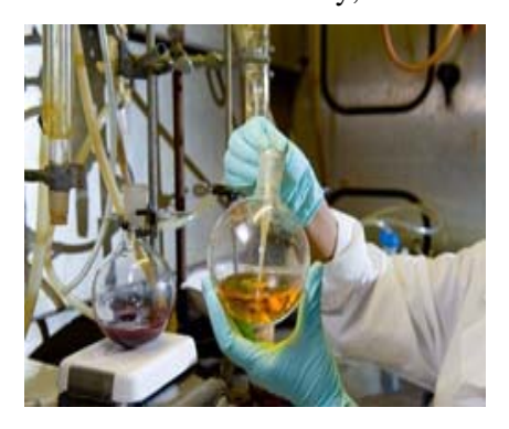
Analysis performed at the Cincinnati Laboratory.

EPA Order 3120.5 implements the federal policy on research misconduct, and the Office of Research and Development and others formulated the Principles of Scientific Integrity and the associated e-training to further highlight professional ethics for EPA scientists. Currently, the Office of Research and Development does not test its policies and