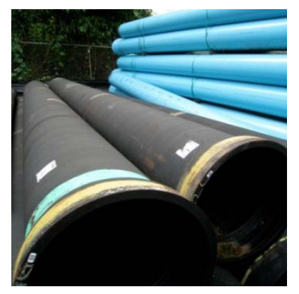
Pipes for a Recovery Act clean water project.

(Report No. 11-R-0208, EPA Faced Multiple Constraints to Targeting Recovery Act Funds, April 11, 2011)