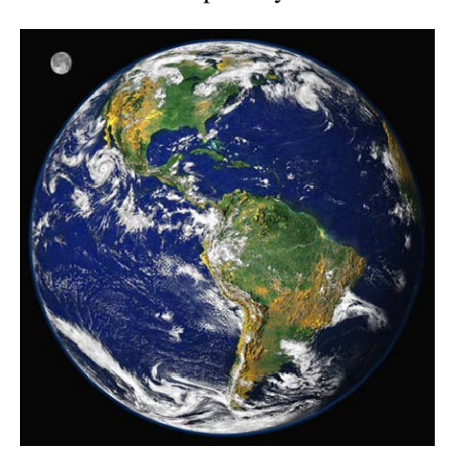
An image of the earth.

On December 15, 2009, EPA published its Endangerment and Cause or Contribute Findings for Greenhouse Gases Under Section 202(a) of the Clean Air Act. As the primary scientific basis for EPA's findings, the Agency relied upon assessments