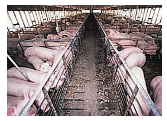
Hog confinement.

A CAFO is a facility where more than 1,000 animal units are confined and fed for a total of 45 days or more in any 12-month period. The Clean Water Act prohibits the discharge