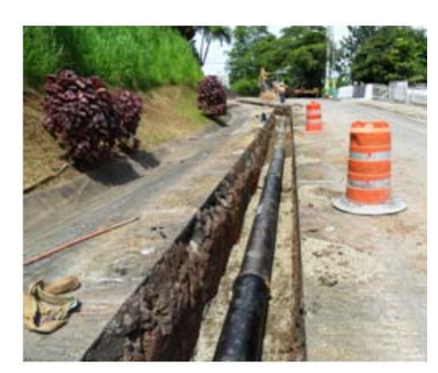
Pipes at the Las Marias Potable Water System Phase IIA construction site.

Fund program, consisting of a $3,189,359 grant and a $2,385,051 loan. We identified no issues that required corrective action. ( Report No. 11-R-0241, American Recovery and Reinvestment Act Site Visit of Las Marias Potable Water System Phase IIA Project, Las Marias, Puerto Rico, May 25, 2011)