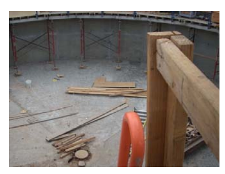
Water treatment facility expansion in Buckeye, Arizona.

As part of OIG efforts to ensure that EPA is spending Recovery Act funds in accordance with requirements, we completed eight site visits during the semiannual reporting period. As part of our visits, we toured the projects, interviewed relevant parties, and reviewed documentation related to Recovery Act requirements. For four sites, we identified no issues that required corrective action by EPA or the recipients, but we found issues at four other sites.