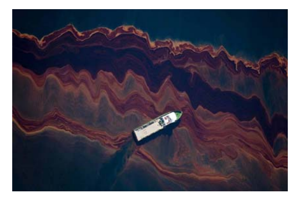
An overhead view of the Deepwater Horizon oil spill.

EPA may have had better efficacy data on dispersants during the Gulf Coast oil spill if it had updated the National Contingency Plan to include a more reliable testing procedure.