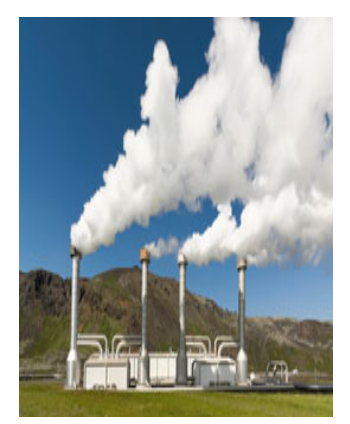
A geothermal plant, part of a greenhouse gas reduction project.

EPA has completed its plan to reduce its own greenhouse gas emissions as required by Executive Order 13514, but projected reductions are contingent on the full funding and implementation of the plan's energy efficiency projects.