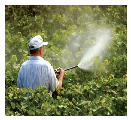
A farmer spraying pesticides.

In 1996, the Food Quality Protection Act gave EPA the authority to screen and test substances that may have an effect in humans that is similar to that of a naturally occurring estrogen, or such other endocrine effects as the EPA Administrator may