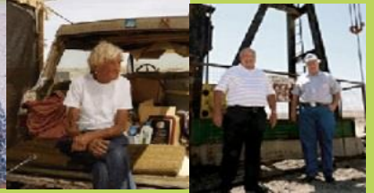
Serving Arizona, California, Hawaii, Nevada, the Pacific Islands, and 148 Tribes