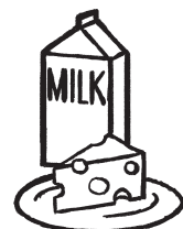
Get Vitamin D Safely