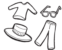
Wear Protective Clothing, Including a Hat, Sunglasses and Full-Length Clothing