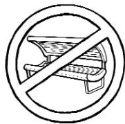
Avoid Sun Tanning and Tanning Beds