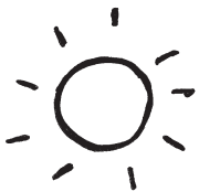
Do Not Burn