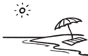
Use Extra Caution Near Water, Snow and Sand