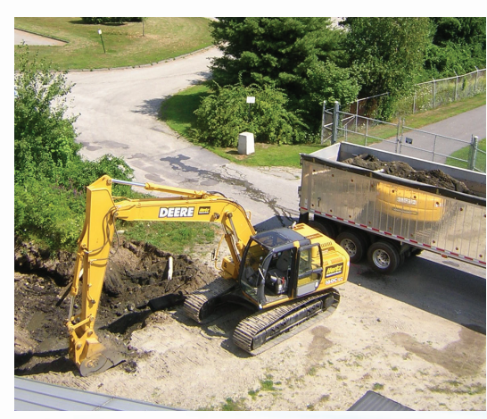
Contaminated soil excavation during remediation phase.

Assessment grants support eligible entities as they inventory, characterize, assess and conduct planning and community involvement related to brownfields. An eligible entity may apply for up to $200,000 to assess a site contaminated by hazardous substances, pollutants or other contaminants and up to $200,000 to address a site contaminated by petroleum. Three or more eligible entities may apply together as a coalition to assess a minimum of five sites.