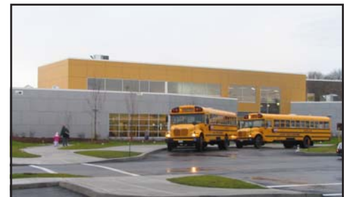
The Meeting Street National Center of Excellence.