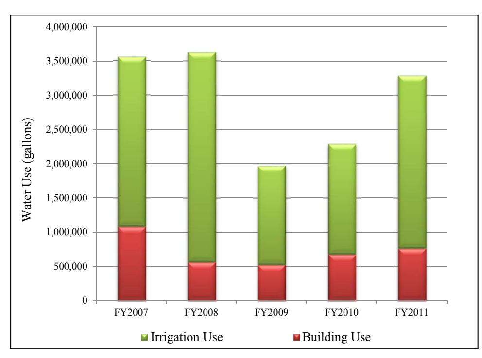
Figure 1. Water Use by Meter, Region 8 Laboratory, FY 2007 through FY 2011

In response to EO 13423, the Region 8 Laboratory set a FY 2007 water use intensity baseline of 70.04 gallons per gsf. In FY 2011, water use intensity was down to 64.66 gallons per gsf—a reduction of 7.7 percent compared to the FY 2007 baseline. Figure 1 provides a graph of the Region 8 Laboratory's water use by meter from FY 2007 through FY 2011.