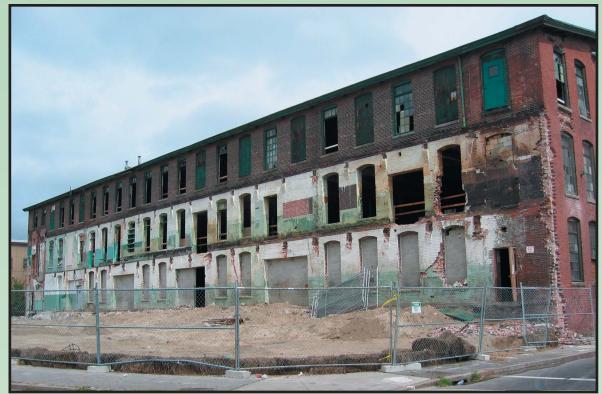
An abandoned building in Providence, Rhode Island.

Given that each type of brownfield grant funds different activities, health monitoring activities under each