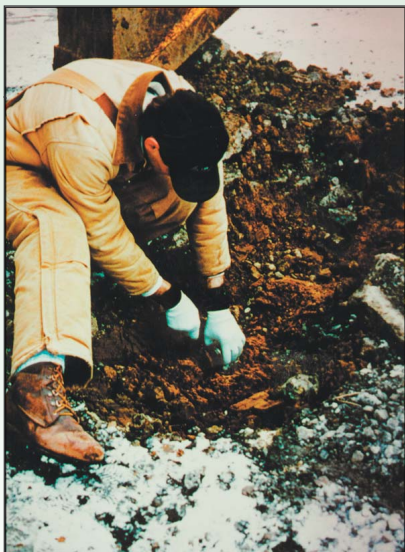
Soil sampling in Louisville, Kentucky.

State and tribal brownfield response programs oversee assessment and cleanup activities at the majority of brownfield sites across the country. Monitoring of the health of populations around brownfield sites may be of interest to states and tribes as they establish and enhance their brownfields response programs.