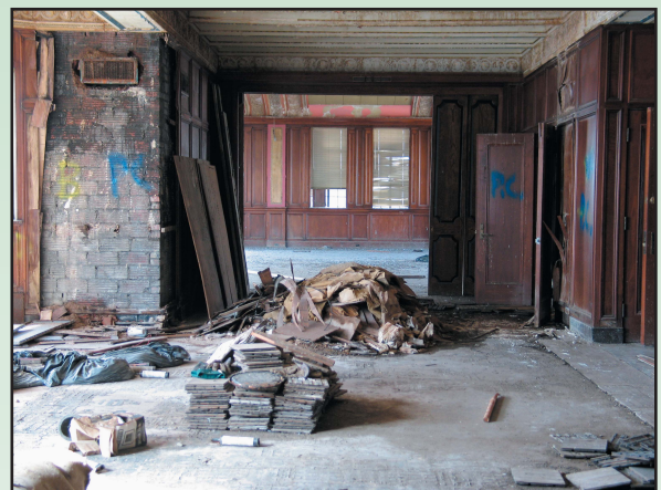
The Skirvin Hotel in Oklahoma City before renovation.

“The collection of health-related qualitative and quantitative data of relevance to brownfield communities and hazardous substance exposures.” (See CDC, for additional information on a definition of public health monitoring)