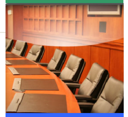
Date: December 15, 2010

When: 9:00 am to 5:00 pm, concluding early if all comments are heard