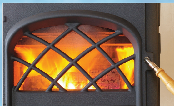
New stoves are available in many sizes and styles. Look for the EPA label on the back that indicates it is certified.

The U.S. Environmental Protection Agency (EPA) recommends replacing old wood stoves with modern heating appliances. This can reduce smoke and dust, as well as cut heating expenses. Making the switch can also help make your home healthier and safer. There are many cleaner-burning options, ranging from gas to high-tech wood stoves certified by EPA.