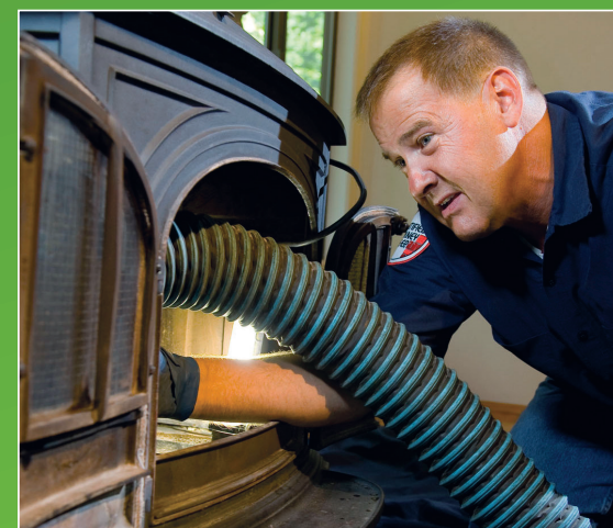
Stoves and chimneys should be inspected by a certified chimney sweep once a year to prevent chimney fires.

Improperly installed stoves or chimneys can spill smoke back into your home or cause a house fire. A hearth specialty retailer can arrange professional installation by a trained technician or one certified by the National Fireplace Institute.®