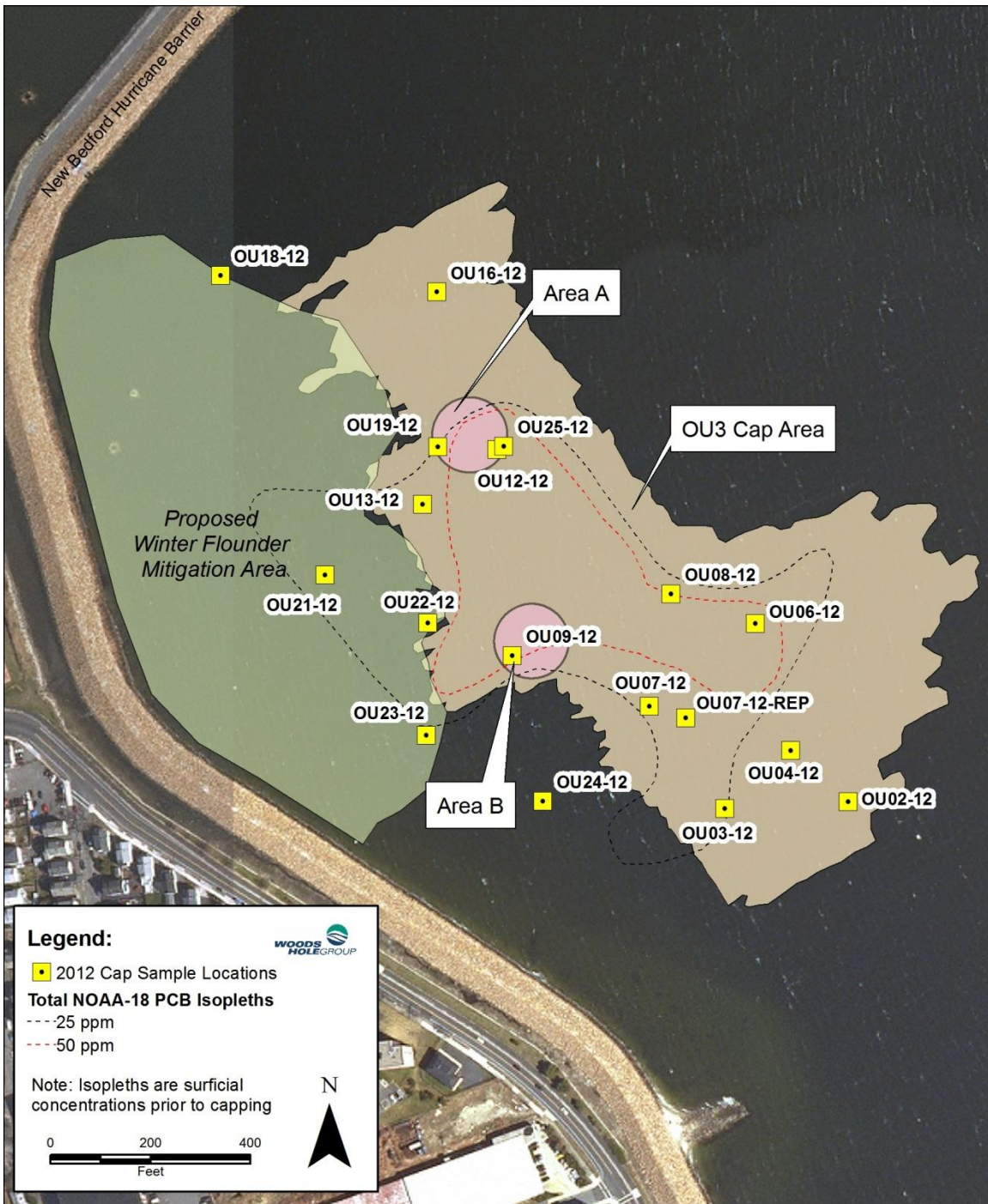
Figure 1. Basemap of the OU#3 Cap and November 2012 sample locations