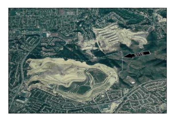
A Class I Landfill in post-closure.

other types of permit information, EPA has not reported basic financial assurance information into its national database. This hampers efforts to ensure that effective plans are in place to provide sufficient funds for closure and post-closure costs.