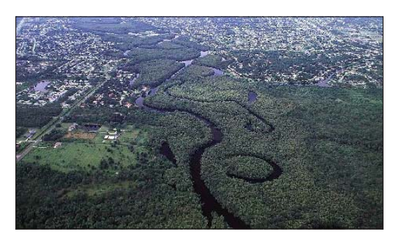
A view of the upper watershed of the North Fork Lucie River, Florida.

If EPA is committed to a watershed approach for achieving clean water, it needs to improve program integration, act on stakeholder concerns, and better address strategic planning and performance measurement.