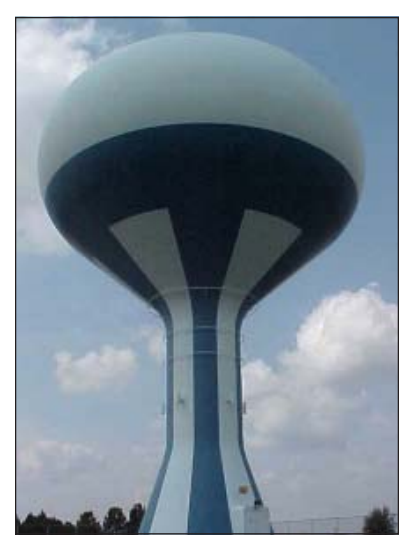
A water tower in the South Central Regional Water District, Burleigh County, North Dakota.

EPA worked to provide guidance and other assistance to States, and provided States with more flexibility in accordance with the Act. More than 86 percent of source waters have been assessed, operators have been trained and certified, assistance to improve capabilities has been provided, low-interest loans are being offered, and consumers are receiving more information on drinking water quality.