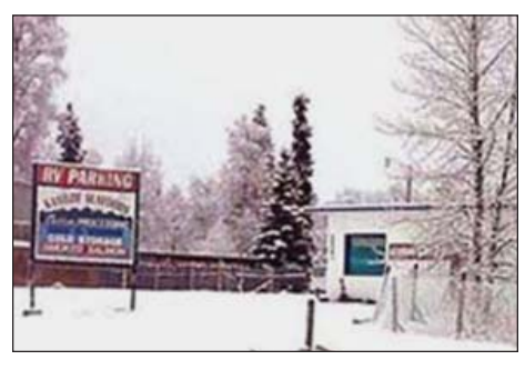
The site of the former dry cleaners at the River Terrace Recreational Vehicle Park, Soldotna, Alaska. The building currently houses a fish processing facility.

Alaska's proposed use of past expenditures on a separate project as "matching" funds for a grant involving cleanup at the River Terrace Recreational Vehicle Park (RTRVP), Soldotna, Alaska, is unallowable.