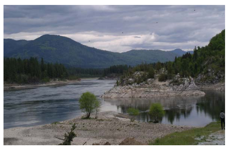
The Upper Columbia River, a hazardous waste site impacting the Confederated Tribes of the Colville Reservation.

We believe that these shortcomings, if not substantially revised, will prevent a credible and reliable inventory from being produced. Moreover, without significant modifications, EPA will be required to make an additional investment in this effort.