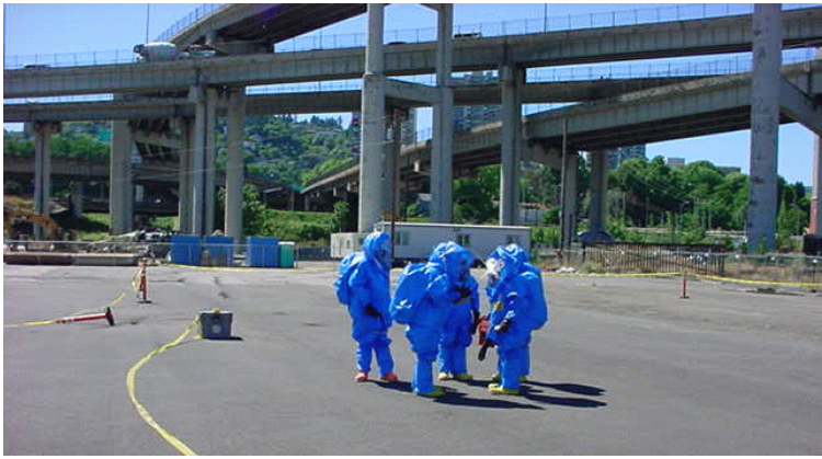
Emergency Response Demonstration Exercise held in Portland, Oregon, using counter terrorism/emergency response equipment.

We did note that EPA complied with the Federal Acquisition Regulation when purchasing counter terrorism/emergency response equipment, and has an adequate process for moving equipment.