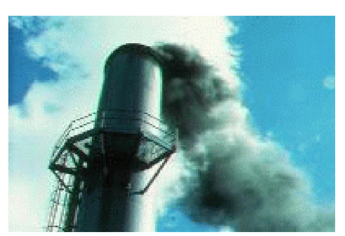
Pollution from an industrial smokestack (photo courtesy New York State Department of Environmental Conservation).

EPA is not certain how much progress it has actually made in reducing air toxics emissions since it established its 1993 baseline. Due to improvements in later inventories, the meaningfulness of comparing new inventories against the 1993 baseline is questionable. For example, although use of State-validated emissions data is EPA's