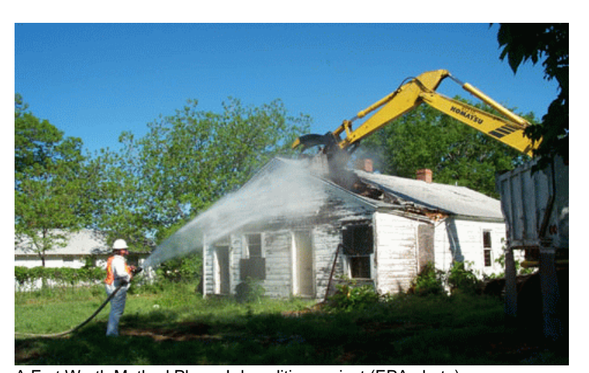
A Fort Worth Method Phase I demolition project.

The current design and methodology of the "Fort Worth Method" for removing regulated asbestos-containing materials during demolition is not adequate to demonstrate protection of human health and the environment, and does not meet applicable EPA criteria. Asbestos is a known human carcinogen.