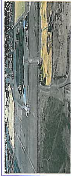
AMPAC currently operates an in-situ remediation system where perchlorate-contaminated

Wash. The discharge water from this remediation system has been consistently less than the Nevada Interim Action Level for perchlorate of 18 micrograms per liter or parts per billion (ppb).