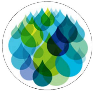
Water N & P Sensors