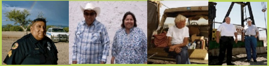
Serving Arizona, California, Hawaii, Nevada, the Pacific Islands, and 148 Tribes

U.S. Environmental Protection Agency Pacific Southwest, Region 9