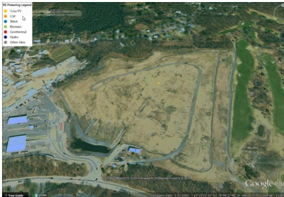
Google Earth Screen Capture of Scituate Landfill in 2005

Area Technical College, to huge utility-scale projects like the 100 MW wind project on buffer land at the Columbia Ridge Landfill in Oregon. More than half of the installations are large-scale systems with a project capacity of 1 MW or greater, either exporting energy onto the utility grid or offsetting onsite energy demands. The Project Tracking Matrix also includes summary statistics of the known installations and provides insight on the use of renewable energy on contaminated properties.