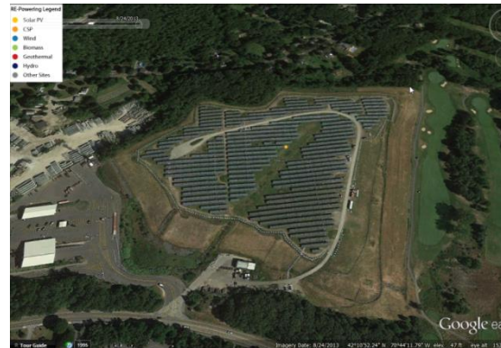
Google Earth Screen Capture of Scituate Landfill in 2013

In conjunction with the updated Project Tracking Matrix, a new addition was made to the RE-Powering Mapper series of Google Earth KMZ files. RE-Powering has now developed a Completed Installations KMZ file that shows the locations of all completed renewable energy installations on contaminated lands identified in the Project Tracking Matrix, overlaid on aerial photography. The file allows users to see installations, as well as use features built into Google Earth to view historical imagery of the site over time and sunlight across the landscape according to time of day.