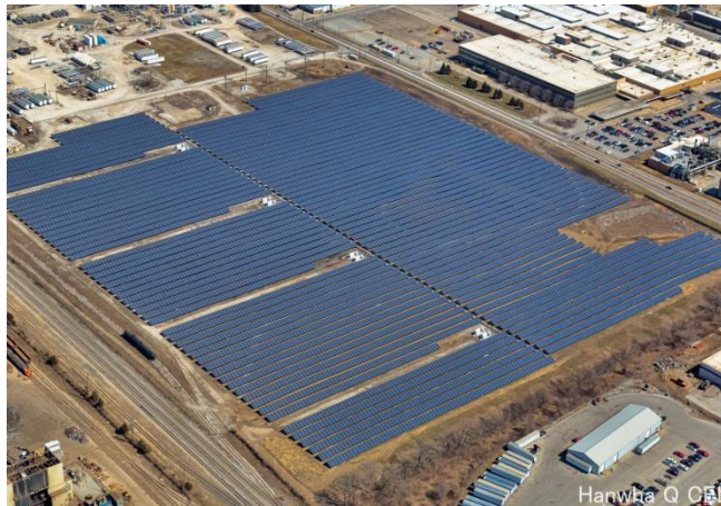
Maywood Solar Farm.

Since the 1950s, the Reilly Tar & Chemical Corporation has produced specialty chemicals and related products at its Indianapolis Plant. For many years, the site also served as a wood treatment facility as well. In 1984, EPA placed the site on the National Priorities List due to extensive groundwater and soil contamination at the property. Although groundwater monitoring operations are ongoing, a significant amount of the cleanup has been completed at the site.