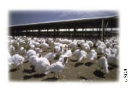
Table 7. Turkeys: size category thresholds