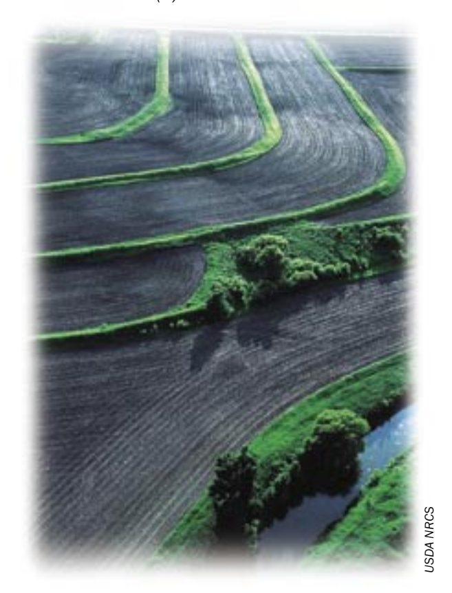
Terraces, conservation tillage, and conservation buffers save soil and improve water quality.

Regulation: 40 CFR 122.41 (h), (k), and (l)(1), (2), (6), (7), and (8)