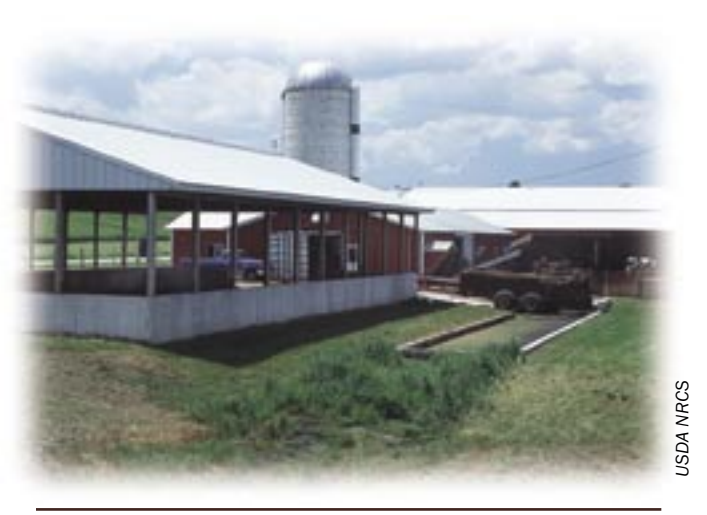
Roofed and concrete wall solid manure stacking facility with a settling basin and filter strip.