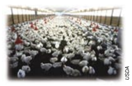
Table 10. Chickens other than laying hens (operations with other than a liquid manure handling system): size category thresholds

Chickens other than laying hens (operations with other than a liquid manure handling system)