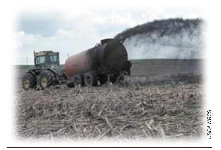
Liquid manure from a hog feeding operation is being land applied.

The federal ELGs require that owners or operators of all Large beef cattle, dairy cattle, veal calf, swine, turkey, and chicken CAFOs properly apply manure, litter, or wastewater to land application areas under their control. The CAFO operator must do this by using BMPs developed in accordance with a nutrient management plan. Your nutrient management plan must be designed to achieve realistic production goals, while minimizing nitrogen and phosphorus movement to surface waters. (See "First special condition for all CAFOs: Develop and implement a nutrient management plan" on page 33 of this guide.)