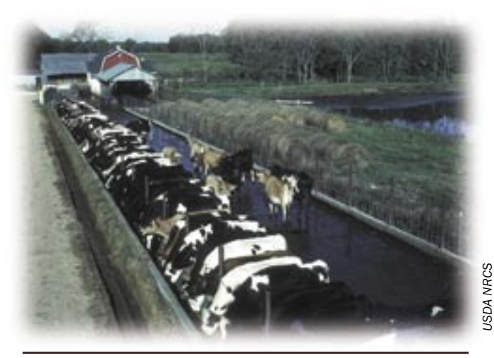
A flush tank and lagoon system keeps the feeding area clean for these dairy cattle. The lagoon also stores nutrients for future application to pastures.

🔼 Regulation: 40 CFR 412.25 [68 FR 7271]