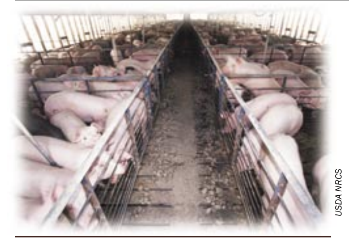
Hog confinement facility.

40 CFR 122.23 (b)(1) defines animal feeding operation (AFO) as a lot or facility (other than an aquatic animal production facility) where the following conditions are met: (1) animals (other than aquatic animals) have been, are, or will be stabled or confined and fed or maintained for a total of 45 days or more in any 12-month period, and (2) crops, vegetation, forage growth, or post-harvest residues are not sustained in the normal growing season over any portion of the lot or facility.