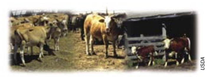
Table 1. Cattle (other than mature dairy cows): size category thresholds