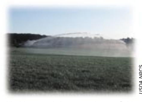
Liquid manure being pumped onto a field.

An eggwashing or -processing facility is part