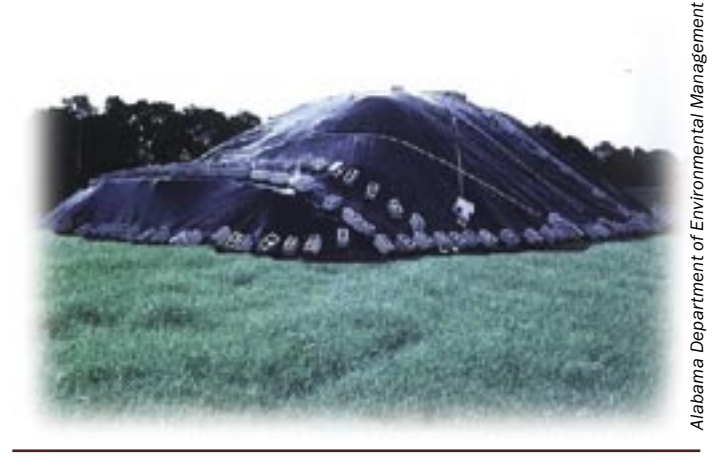
Covered, temporary poultry litter storage.

Your nutrient management plan has to describe the practices at your operation that achieve the discharge limits and specific management practices in your NPDES permit. If the minimum elements described above don't address all of the discharge limits and specific management practices in your permit, you'll have to include the missing elements in your plan.