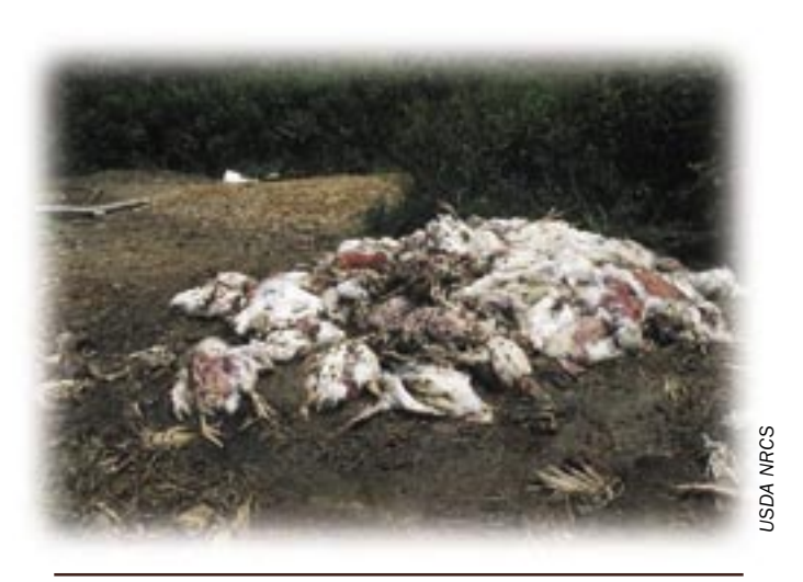
Improper disposal of dead chickens poses a water quality concern.

Properly dispose of dead animals and livestock to prevent disposal in the wastewater treatment system and to prevent discharges of pollutants to surface water.