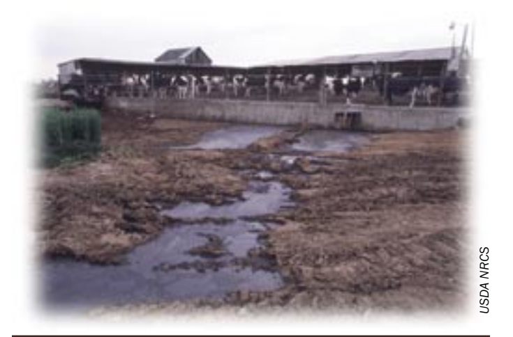
Runoff from this livestock yard could enter a nearby stream and degrade the water quality. Such conditions might be the basis for designating an AFO as a Small CAFO.

EPA and the United States Department of Agriculture (USDA) promote efforts by states to use approaches other than NPDES permitting to help medium and small AFOs to avoid having conditions that would result in those facilities' being defined or designated as CAFOs. For example, the voluntary development and implementation