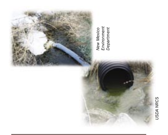
A pipe or ditch that carries wastewater to a stream is a discrete conveyance.

A discrete conveyance, in general, is any single, identifiable way for pollutants to be carried or transferred to waters, such as a pipe, ditch, or channel.