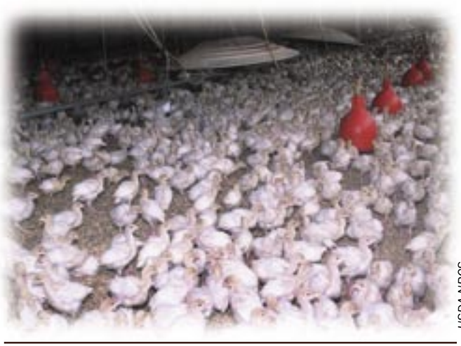
A confinement area for turkeys. The confinement area is considered part of the production area.

Examples of areas where you might confine animals are open lots, housed lots, feedlots, confinement houses, stall barns, free stall barns, milkrooms, milking centers, cowyards, barnyards, exercise yards, medication pens, walkers, animal walkways, and stables.