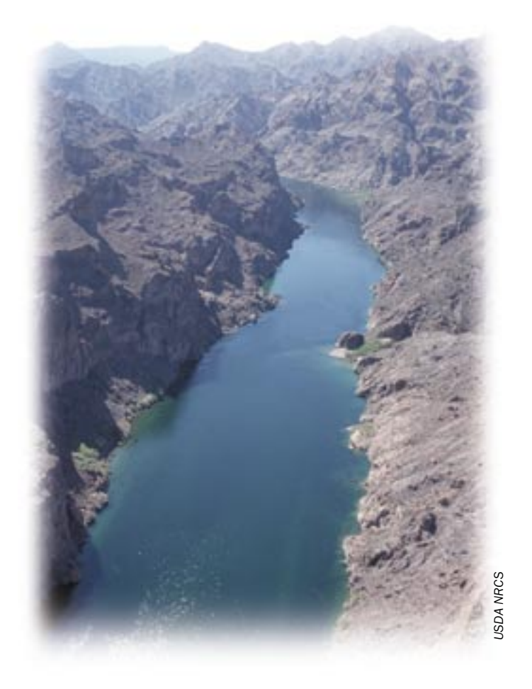
Table 14. Size category thresholds for newly defined CAFOs

Newly defined CAFOs are operations that are defined as CAFOs as of April 14, 2003 (the effective date of the revised regulations), but were not defined as CAFOs under the old NPDES regulation. Your operation might be a newly defined CAFO if it is a dry waste chicken operation, a stand-alone dairy heifer operation, or a swine nursery that existed before April 14, 2003. Your operation might also be a newly defined CAFO if you were entitled to the 25-year, 24-hour storm permitting exemption under the old regulation. That exemption has been eliminated. Table 14 shows which operations are newly defined CAFOs. If you own or operate a newly defined CAFO, you should contact your permitting authority to find out when to apply for an NPDES permit. Each permitting authority may set its own deadline for when you must apply, but the deadline must be no later than February 13, 2006.