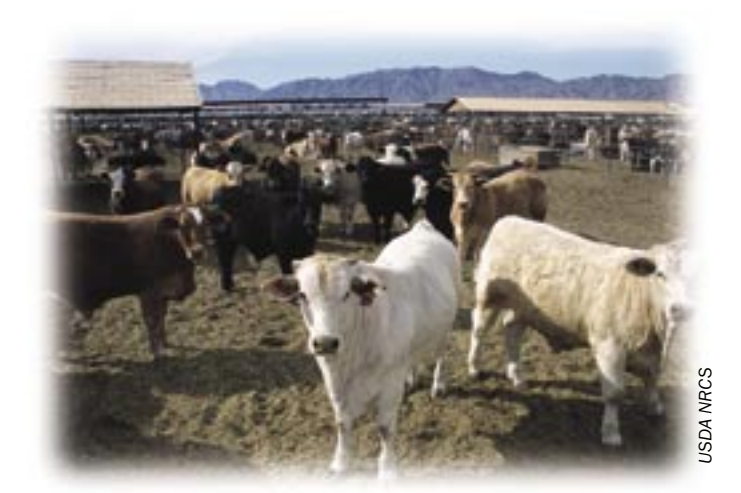
Confined cattle feeding operation.

This does not mean that any vegetation at all in a confinement area would keep an operation from being defined as an AFO. For example, a confinement area like a pen or feedlot that has only "incidental vegetation" (as defined by your permitting authority) would still be an AFO as long as the animals are confined for at least 45 days in any 12-month period.